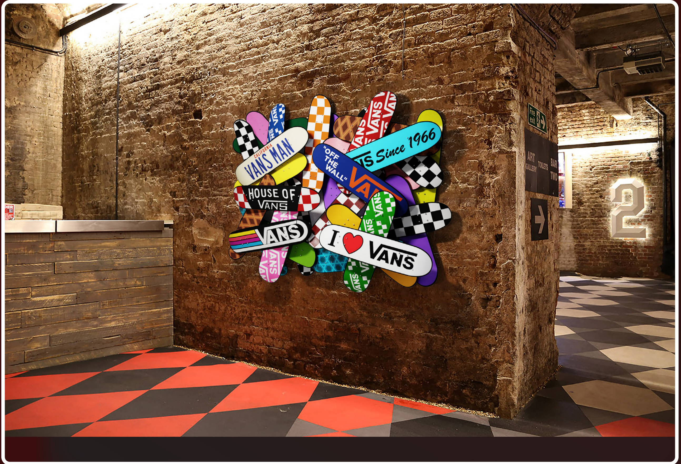
vans 2 56" x 78" x 13" Acrylic paint on skateboards